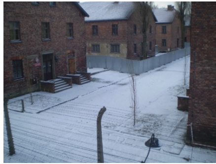
Figure 1. View from window where author slept in Auschwitz I. It looks out at the infamous brick barracks.

The location of Auschwitz-Birkenau is about an hour train ride from Krakow in Southern Poland. Built within the small industrial town of Oswiecim, the site is easily accessible from the train, approximately one kilometer and a half by foot to reach it. This author had the opportunity to visit the memorial site on two occasions: August 2004 and October 2011 as part of a research trip. 3 Upon arrival, especially if it is a first visit, one may be taken aback by the hamburger joint near the entrance, souvenir shop, and machines to buy drinks. The main entrance located in Auschwitz I consists of brick barracks, a visitors' center, and a parking lot for visitors. To get into the site, one must walk through the infamous Arbeit Macht Frei gate.