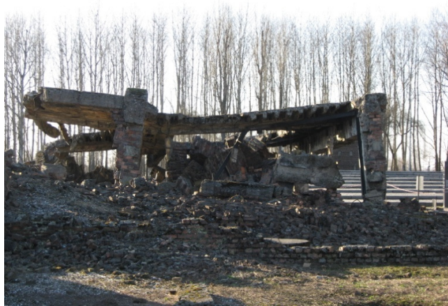
Figure 5. Crematorium ruins Birkenau.

With the grappling and passing of time along with the ongoing deterioration of the material testimony to Auschwitz, the Auschwitz museum was obliged to undertake complex, long-term conservation tasks. The Auschwitz-Birkenau Foundation, established in 2009 assumes that the annual sum of four to five million Euros will make it possible to plan and systematically carry out essential conservation work at the Memorial and Museum Auschwitz-Birkenau. It has dedicated itself to raising a Perpetual Capital Fund of 120 million Euros. According to Jacek Kastelaniec responsible for fundraising for the site, "it is a universal cause and this is our main idea that needs to be understood by everybody. It should not be only a question of people with Jewish roots. It is not enough. It is humanity and it could happen to everybody. For me it is important to keep the symbol of this whole tragic history and to keep it going” (J. Kastelaniec, personal communication, February 9, 2011).