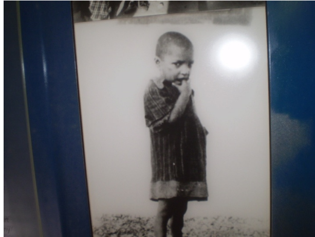
Figure 8. Photo of child taken by author. Museum to Roma and Sinti, Auschwitz I.

the Auschwitz director is proof on the ground that with action taken, progress can be made; that with international cooperation and a framework, memorial sites can be preserved. Auschwitz-Birkenau is a place of death with no life yet life. Activity is constant and we are reminded of its important place on humanity's world stage; where the world can gather so as not to forget the horrendous consequences when racism, xenophobia, anti-Semitism, bigotry, and intolerance are permitted to be revealed and tolerated. Management's evil side exposed itself to the extreme in Auschwitz.