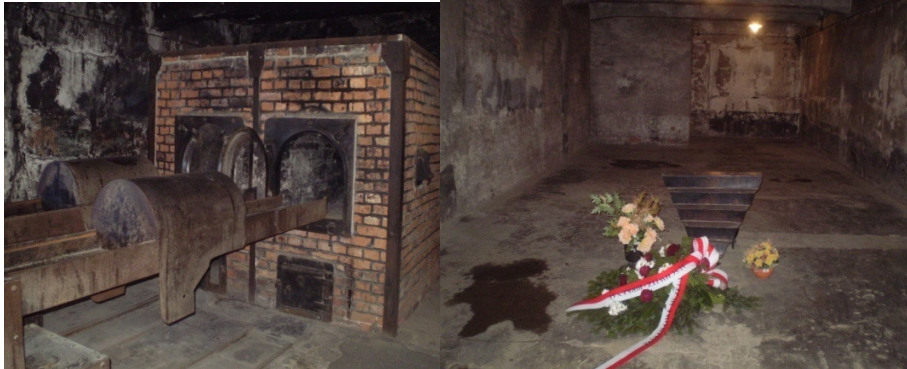
Figure 3. Ovens and gas chamber in Auschwitz I.