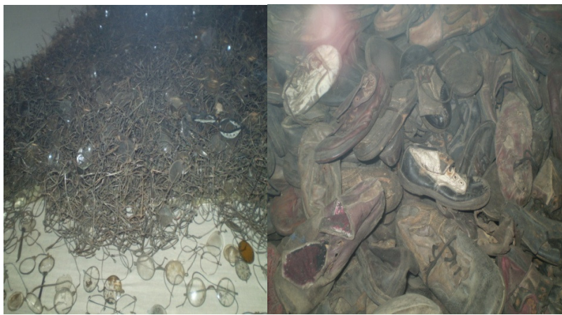
Figure 4. Glasses and shoes which need to be properly preserved. Auschwitz I, taken by author.