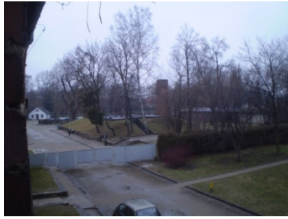
Figure 2. From window where author slept. View of chimney from gas chamber and crematorium (left).

Birkenau is located approximately three kilometers from Auschwitz I, and there is a shuttle bus which transports visitors to the second site. Those who do not realize they should visit Birkenau do not experience Auschwitz in its entirety. Operated and managed as one unit, they are also separate entities, providing the viewer with two perspectives combining to make up the whole and complete picture of the hell which happened there. Each one is dependent on the other to give the visitor the complete story. Graphic in nature with its imprints of ash pits, tracks, crematorium ruins, and remnants of barracks as well as those which still remain, the massive totality of destruction reels the senses. The enormous size of the site makes the Nazi death factory all the more an unimaginable reality.