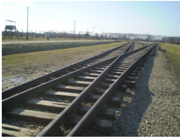
Figure 9. Tracks in Birkenau which sprawl and illustrate the massive death factory.