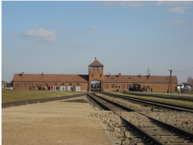
Figure 6. Tracks in Birkenau and tower entrance.

Included is a diagram of the management structure, courtesy of the Auschwitz-Birkenau Memorial Museum. It consists of approximately 250 employees and volunteers.