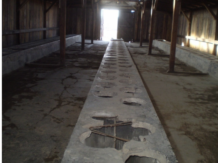
Figure 7. Toilets in wooden barrack in Auschwitz II or Birkenau, taken by author.

and the future of Auschwitz. Operating on the idea that the perpetual fund from the Auschwitz-Birkenau Foundation will not be spent but rather invested, so that the annual income from the investment will secure the site, the most urgent repairs could immediately be done.